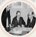
William F. Lamb Arthur Harmon Richmond Shreve EMPIRE STATE BUILDING