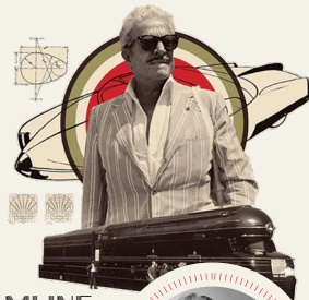
Raymond Loewy STREAMLINE DESIGN